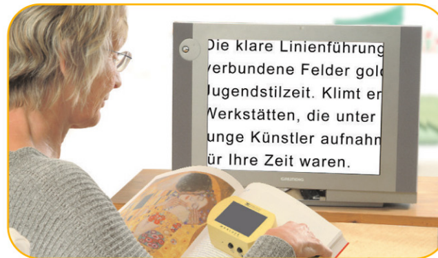
MAXLUPE MINI PLUS

I take my MAXLUPE MINI with me wherever I go!