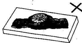
Never let the metal band touch the case back as it will affect the signal reception